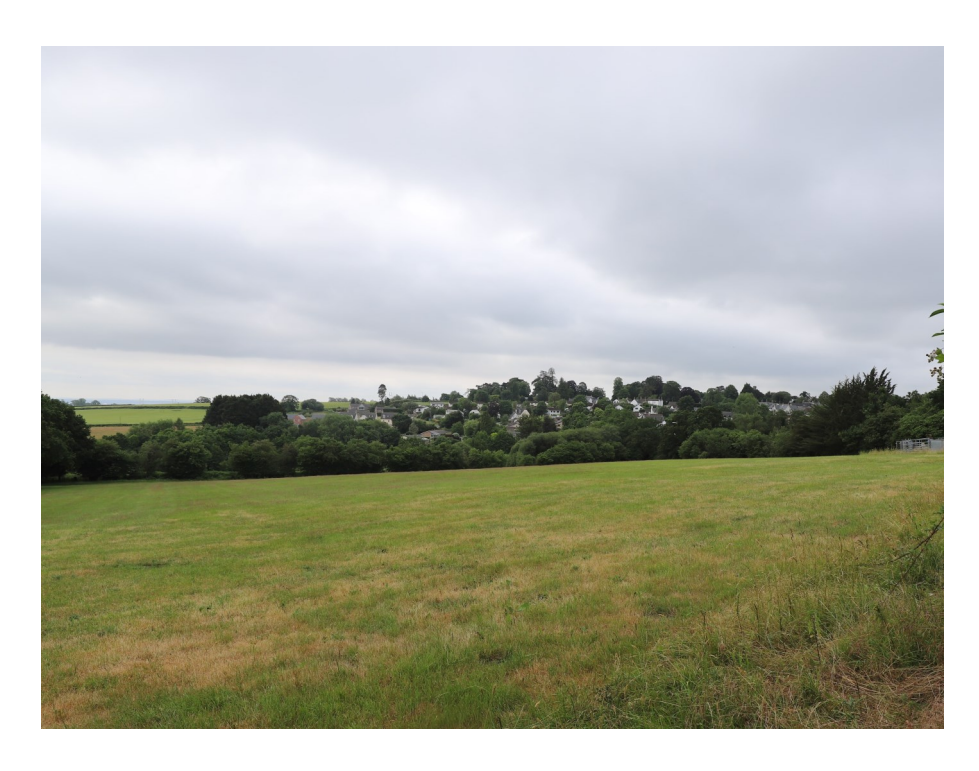
SHIRENEWTON FROM MYNYDDBACH