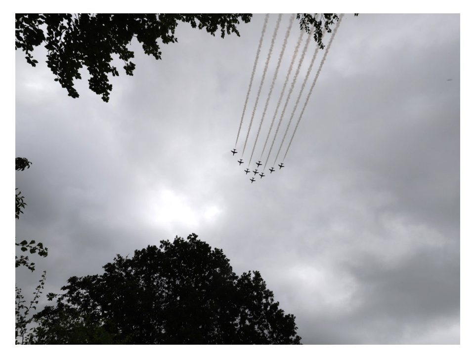
THE RED ARROWS FLY OVER TO MARK THE OPENING OF SHIRENEWTON SCHOOL FETE